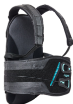
Horizon PRO 456