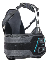
Horizon PRO 464