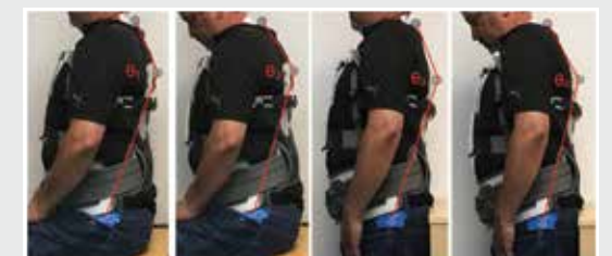
Comparative Evaluation of Spinal Orthoses in Flexion Motion: A comparison of the Sierra™ Hyperextension TLSO and the Align Orthosis

Our data suggests that the new Align PJK Orthosis provides better sagittal motion restriction than a Jewett-style Hyperextension TLSO in the sitting and standing positions. The data also suggests that the new Align PJK Orthosis provides equal sagittal motion restriction compared to a Jewett-style Hyperextension TLSO when moving from sitting to standing.