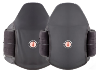
Aspen Evergreen™ 637 LSO Aspen Evergreen™ 631 LSO LoPro ADJUSTABLE ONLY