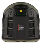
Aspen Contour™ LSO