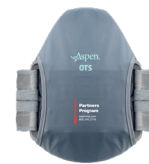
Aspen OTS™ LSO 650 Aspen OTS™ LSO 648