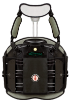
Aspen Contour™ TLSO