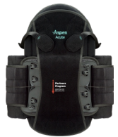
Aspen Sierra™ TLSO 464 ADJUSTABLE ONLY