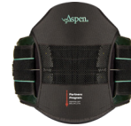
Aspen Summit™ 637 LSO Aspen Summit™ 631 LSO ADJUSTABLE ONLY