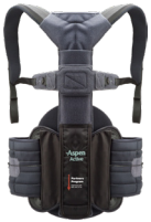
Aspen Active™ P-TLSO