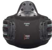
Aspen Vista™ 637 LSO Aspen Vista™ 631 LSO LoPro