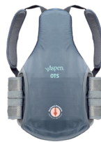
Aspen OTS™ TLSO 457