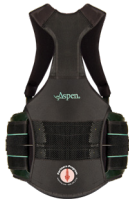
Aspen Summit™ 456 TLSO ADJUSTABLE ONLY