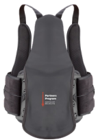
Aspen Evergreen™ 456 TLSO