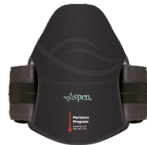
Aspen Horizon™ 639 LSO Aspen Horizon™ 637 LSO Aspen Horizon™ 631 LSO