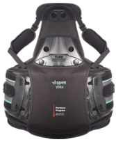
Aspen Vista™ 464 TLSO